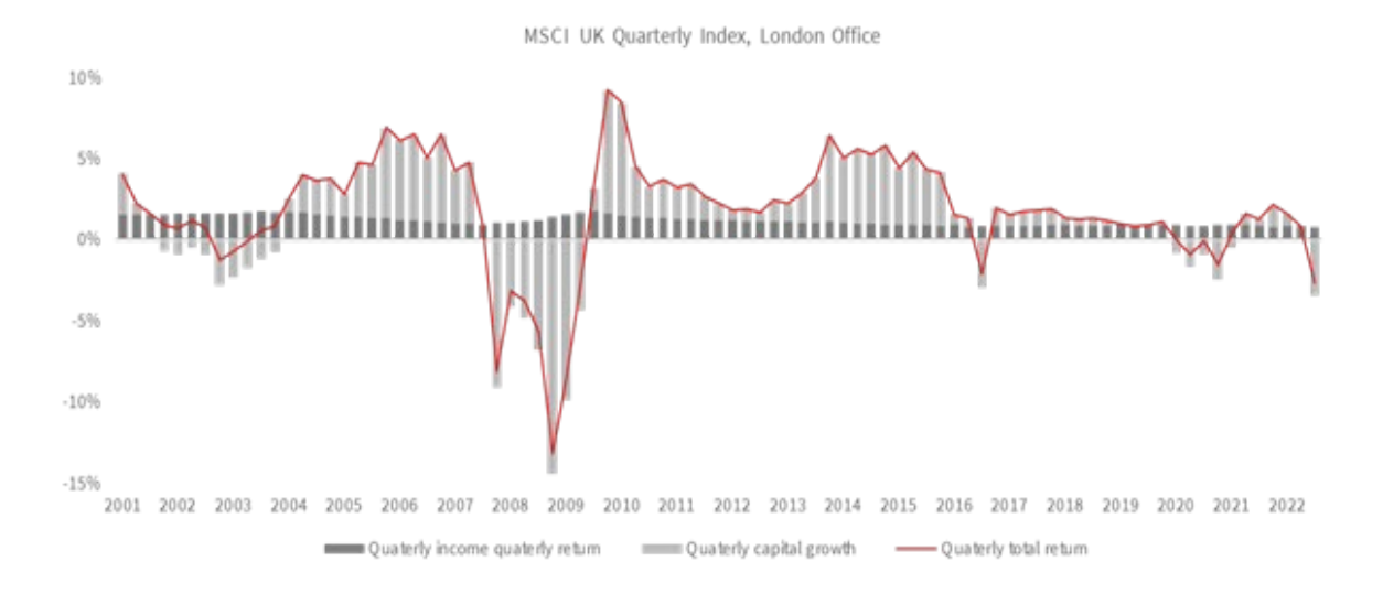
Chart 1: Income return, capital growth and total return associated with holding central London offices over last 20 years

3.3 The chart shows that, although the returns associated with holding central London offices are volatile, that volatility is driven largely by changes in capital value. Income return over the last 20 years has been relatively stable, with a quarterly average of 1.1 per cent.